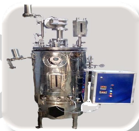
Production Scale SS Fermenter