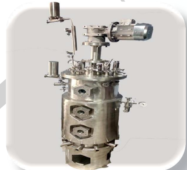
Pilot Scale Fermenter