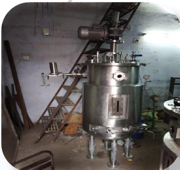
Pilot Scale Fermenter